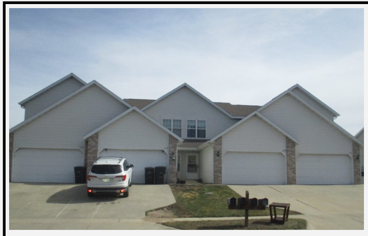
441-453 Nygaard St